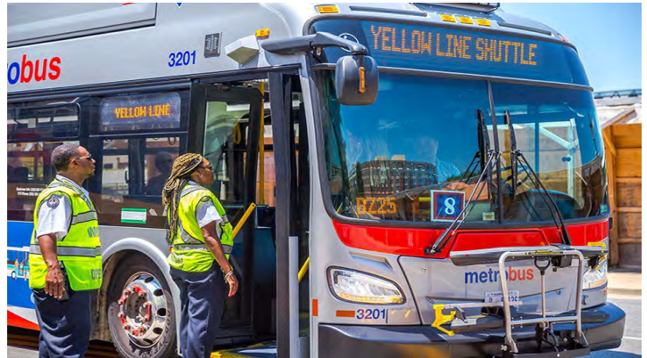
Construction and shuttle photos courtesy WMATA