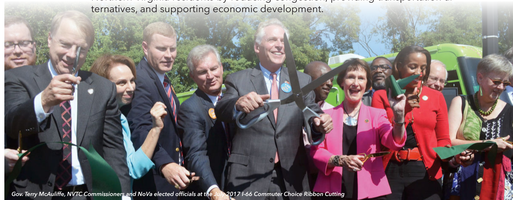
Gov. Terry McAuliffe, NVTC Commissioners and NoVa elected officials at the July 2017 I-66 Commuter Choice Ribbon Cutting

Commuter Choice turns 10! The program continues to improve quality of life for Northern Virginia residents by reducing congestion, providing transportation alternatives, and supporting economic development.