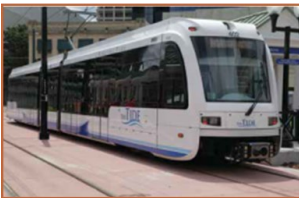
Light Rail Transit (LRT)