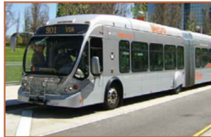
Bus Rapid Transit (BRT)