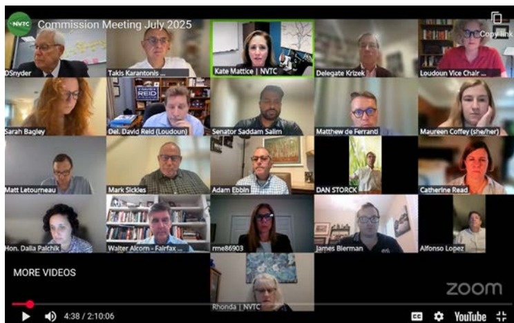
July 2025 all-virtual Commission Meeting

NVTC staff also updated Commissioners on the current phase underway for the planned Envision Route 7 BRT connecting Tysons to Alexandria, by way of Falls Church and Seven Corners. This study builds on previous research and examines the portion between Seven Corners and Alexandria. It's also taking a further look at options in the City of Falls Church.