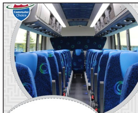
NVTC's Commuter Choice program would help create a new OmniRide route: Gainesville to Washington Union Station.