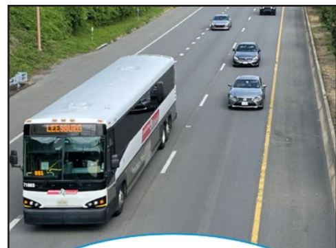
NVTC's Commuter Choice program would help create a new direct Loudoun County Transit route: Leesburg to Washington, D.C.

The public comment period for projects under consideration for I-66 Commuter Choice funding opened March 4 and closes on April 3. All public comments will be brought to the PAC at the April 16 meeting. The committee also heard an update on the I-66 Needs Assessment, a joint study between NVTC and DRPT to identify short- and long-term projects that could seek future funding through either the I-66 Commuter Choice or Virginia Department of Rail and Public Transportation (DRPT) I-66 Outside the Beltway funding programs.